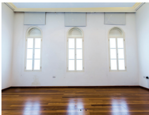
Council Room $100 / hr