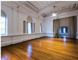
Blue Room $2,000 / 4hrs $1,000 / day †

Minimum 4-hour booking, unless otherwise indicated. Setup/teardown rates thereafter at 60% of published rate.