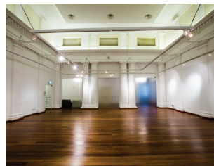
Gallery II $1,900 / 4hrs $1,000 / day †