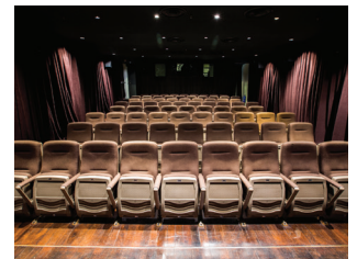
Screening Room $800 / 4hrs $150 / 2hrs (Film screenings only)

† Note: F&B is not allowed at this venue