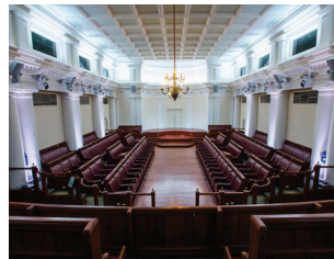
Chamber † $2,500 / 4hrs